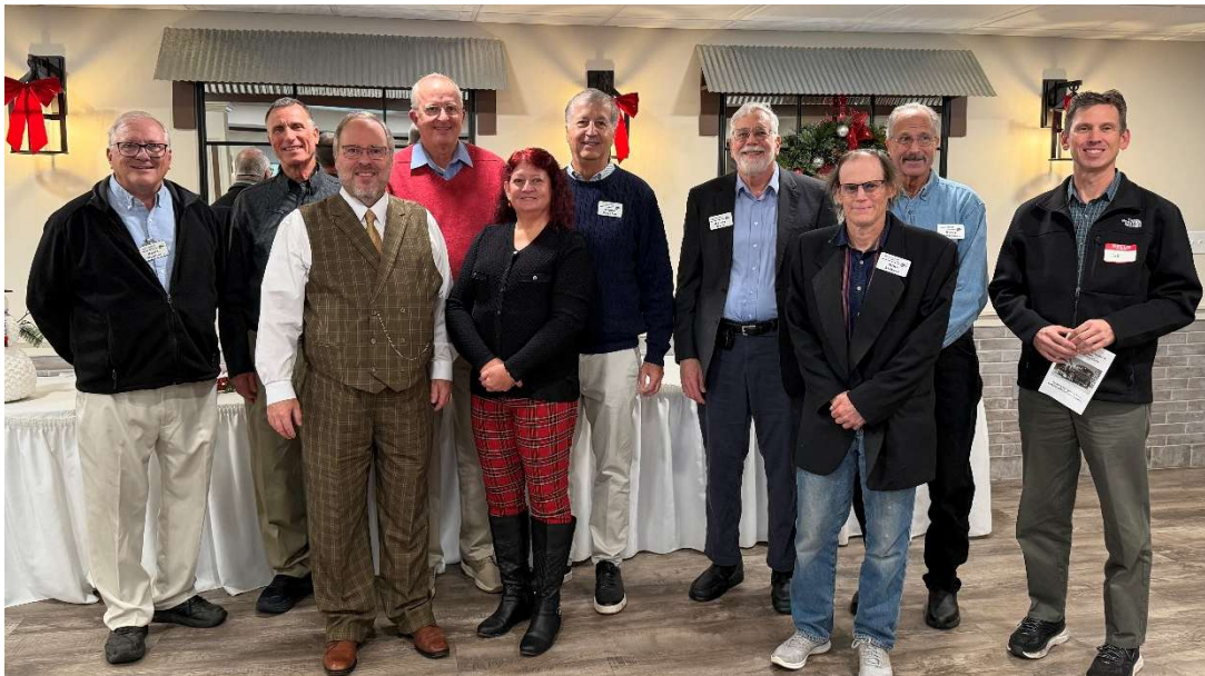
Photo: Incoming and Outgoing Board Members