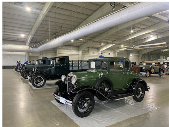
Fine Point Judging