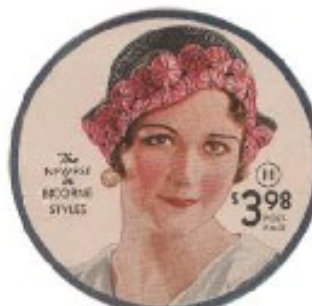
National Bellas Hess Co Inc Spring and Summer 1931 Applied plush flowers