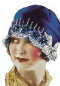
The Robert Simpson Co Fall and Winter 1928-29 Plush blossoms with tinsel stitching

Below are some "New-Old-Stock" (NOS) flower trimmings from an era Millinery supply.