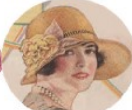
Sears Roebuck and Co Fall and Winter 1928-29 sheer organdy and rayon plush