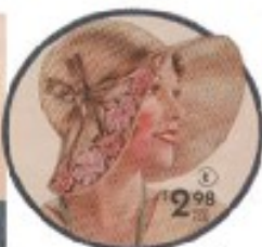
National Bellas Hess Co Spring and Summer 1931 Velvet flowers