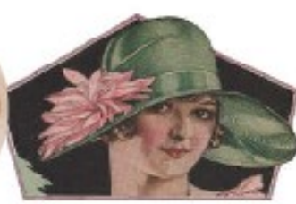
Sears Roebuck and Co Fall and Winter 1928-29 Organdy and rayon taffeta

Catalogs such as Sears and Montgomery Wards sold separate flowers and floral collections that could be used to freshen up old hats or add to new hats and garments. It seems odd that most of the time these catalogs showed them in black and white, but just a few color ads are to be found to help demonstrate the vivid colors that were available.