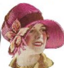
The Robert Simpson Catalog Fall and Winter 1928-29 Velvet orchid