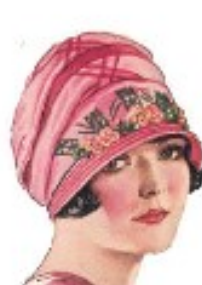
Sears, Roebuck and Co Spring and Summer 1928 Handmade fabric flowers

Robert Simpson catalog Fall and Winter 1928-