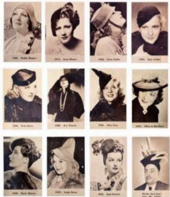
1930's Hat Fashion - timeline - 1930 to 1940