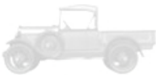
1928 29 OPEN CAB PICKUP (170 A)