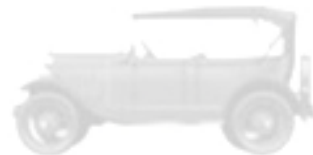
1930 31 STANDARD PHAETON (155 B)