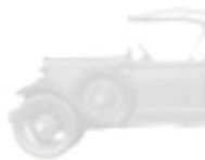
1930-31 OPEN CAB PICKUP (76 B)