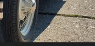
1930-31 CLOSED CAB PICKUP (82 B)