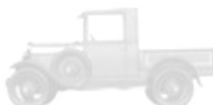
1928 29 CLOSED CAB PICKUP (182 A)