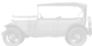
1928 29 STANDARD PHAETON (155 A)