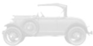
1930 31 DELUXE ROADSTER (140 B)