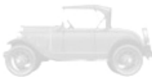
1930 31 STANDARD ROADSTER (140 B)