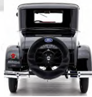
1928-29 STANDARD COUPE (45 A)