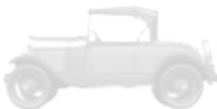
1928 29 STANDARD ROADSTER (140 A)