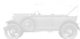
1930 31 DELUXE PHAETON (155 B)