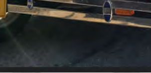
1928-29 CLOSED CAB PICKUP (82 A)