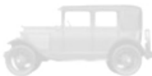
1928 29 LEATHERBACK FORDOR (170 A B)