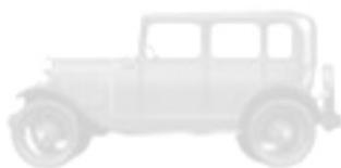
1930 31 SLANT WINDSHIELD FORDOR (140 A B C)