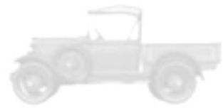
1930 31 CLOSED CAB PICKUP (182 B)