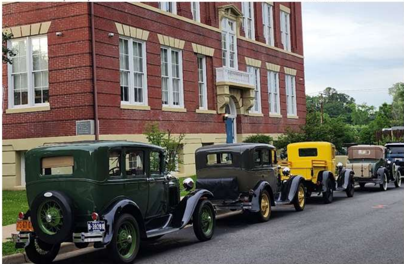
Just a couple of pictures from the MARC & MAFCA meet & tours in June with Friends