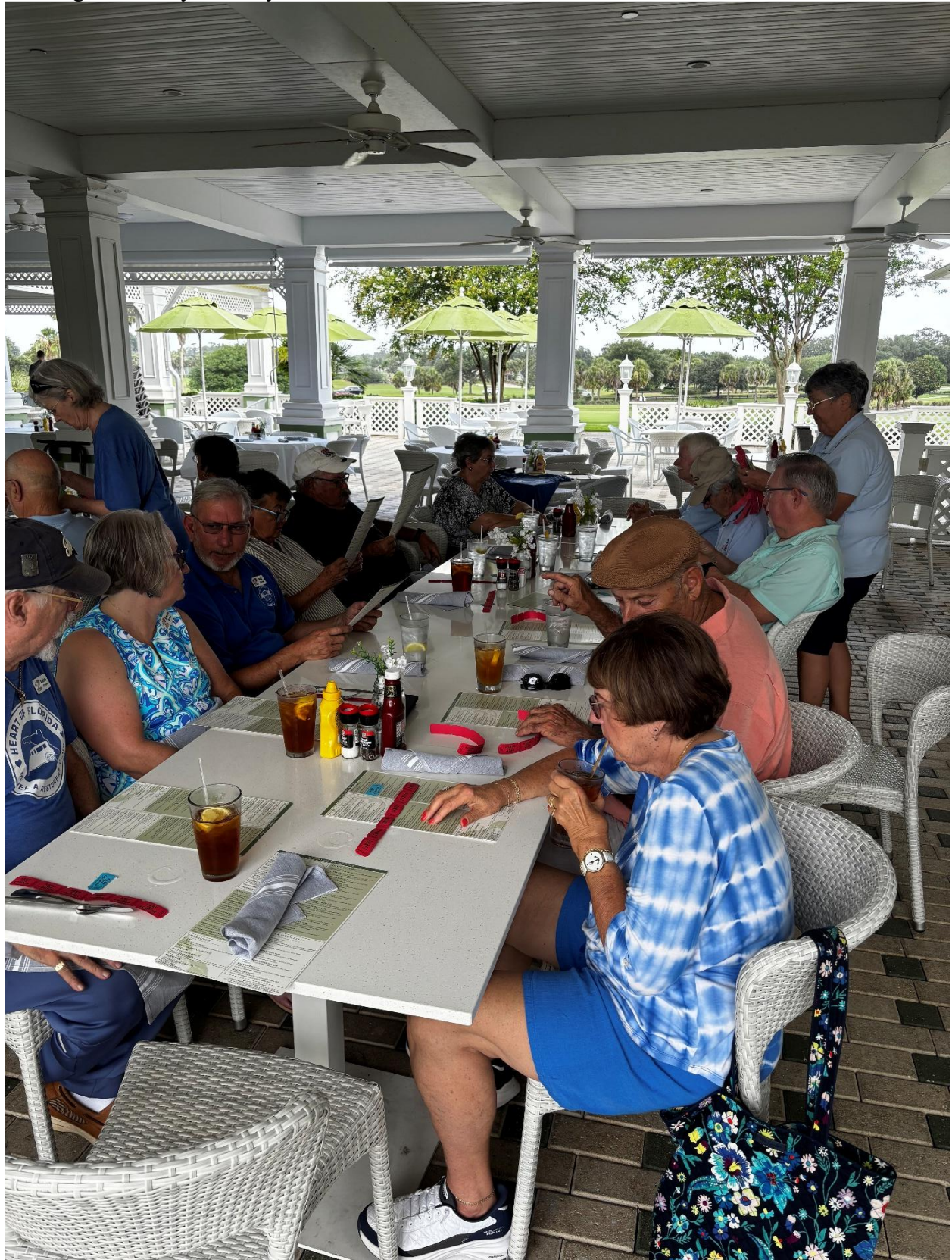
Meeting at Mallory Country Club