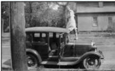
What's this lady doing, adjusting the visor?