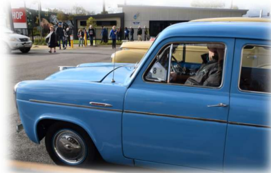
Briefing before heading off