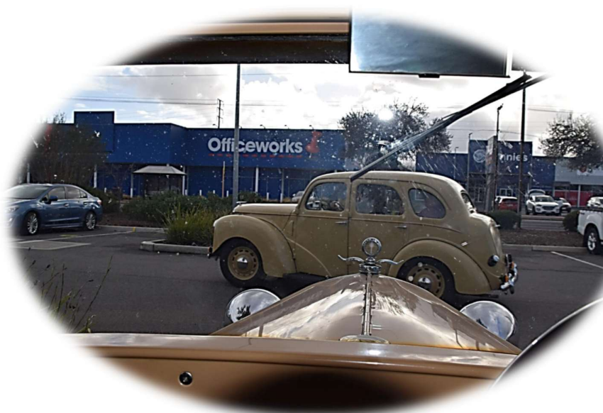
The Start of the Ford FlatHead Funday

CHECK OUT OUR NEW FACEBOOK PAGE MODEL A FORD CLUB OF SA