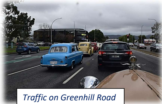
Traffic on Greenhill Road