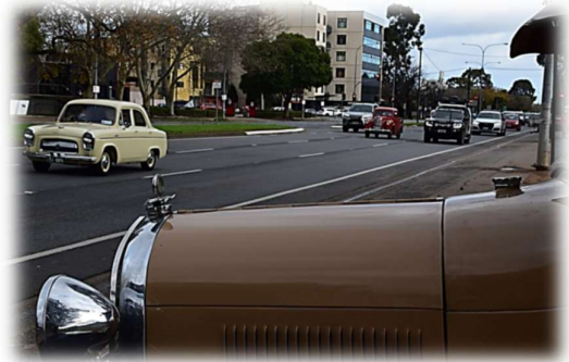
Just givin' them littl'uns a head start!