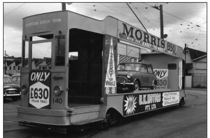
Morris 850 - 27 th March 1961