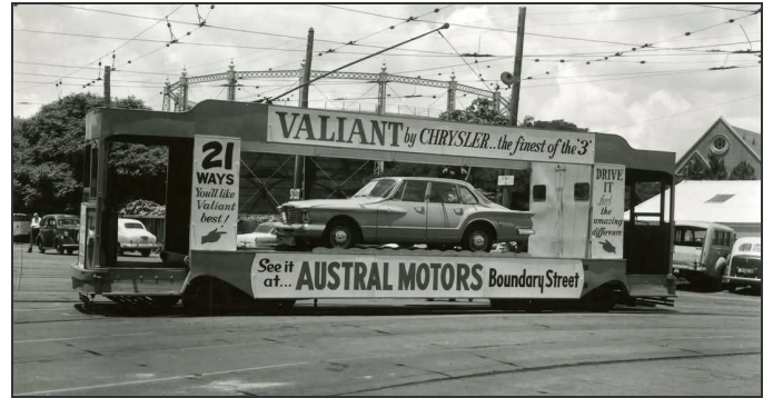
1962 Chrysler Valiant - 19 th January 1962