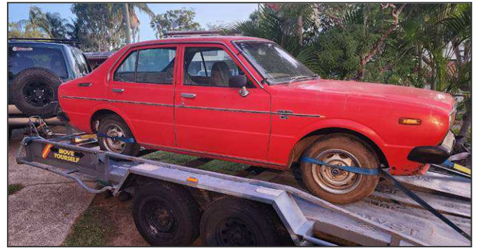
When Lachlan purchased the Corolla

Lachlan bought the car in February 2023. It had been flooded in the 2022 Lismore floods.