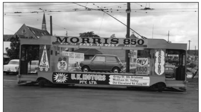
Morris 850 - 27 th March 1961