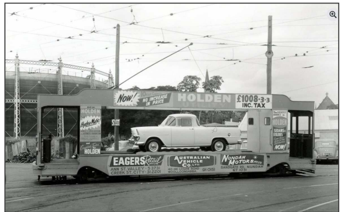
1961 Holden EK Utility - May 1961