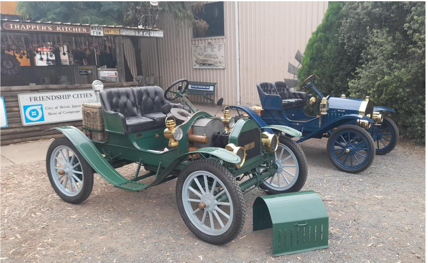
Glenn and Jenny's Brush beside a similar example on the rally

Our first outing went reasonably well for a car that had not been rallied for around 10 years, we both really enjoyed the experience, and the Rally organisers deserve credit for a great Rally. The furthest it had been in our ownership was around the block! We picked up a flat tyre on day 2 and fine cracks in the cylinder manifested themselves in coolant leaks. Still, in all other respects the car ran well and was happy sitting on about a smooth 35 kmh. Some more work to do in order to be ready for the 2025 Brush rally in Albany, WA though! Glenn Campbell.