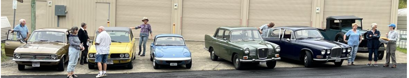
Line up in front of Coramba Fire Shed