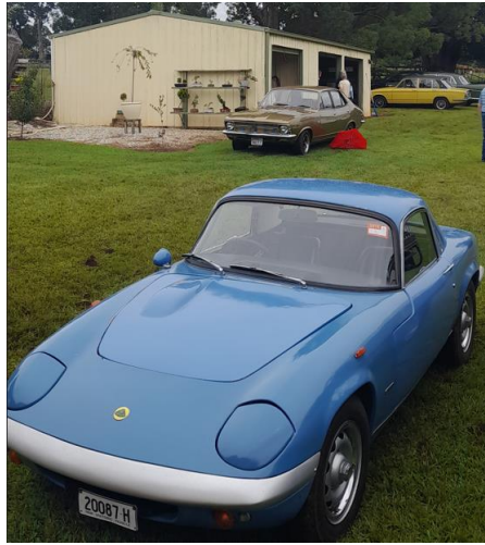
Great to see Carol in the Lotus