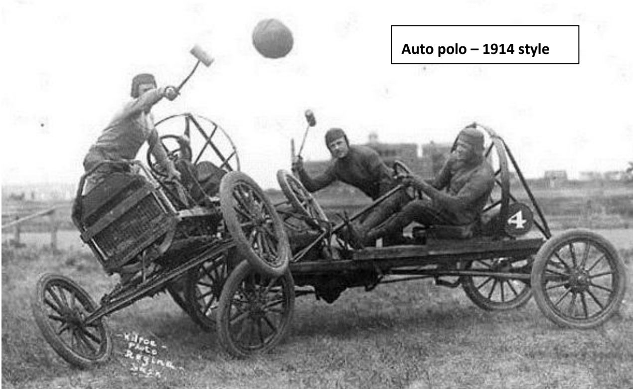
Auto polo – 1914 style

Auto polo was a brief craze in the 1910's to 1930's. It was extremely dangerous and generally used obsolete Model T Ford chassis. More about this crazy sport can be found at the web links below – even a YouTube video showing some original footage!