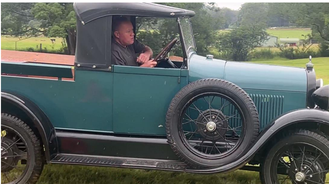
The 94 year old A Model seemed to enjoy a bit of sport!