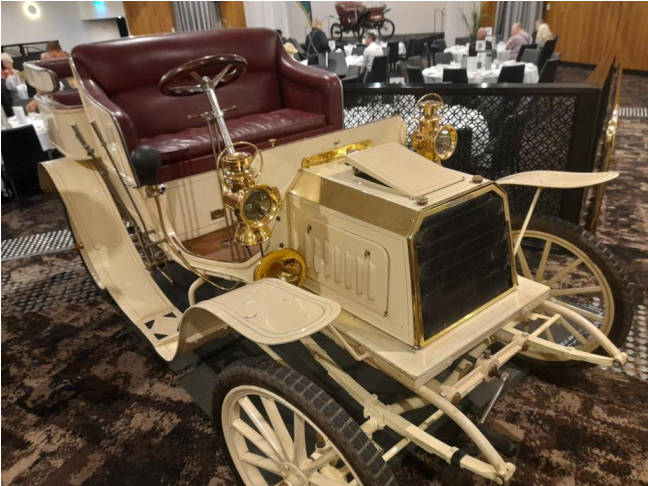
1903 Carlton forming dinner backdrop

Another interesting car was a 1909 Schacht high wheeler, an American car designed for rural roads with wagon wheels. A very rare one was the 1903 Carlton, a British car of 9 HP and the only one in existence. It's engine rotates counter clockwise, the same odd arrangement as the Brush Marque.