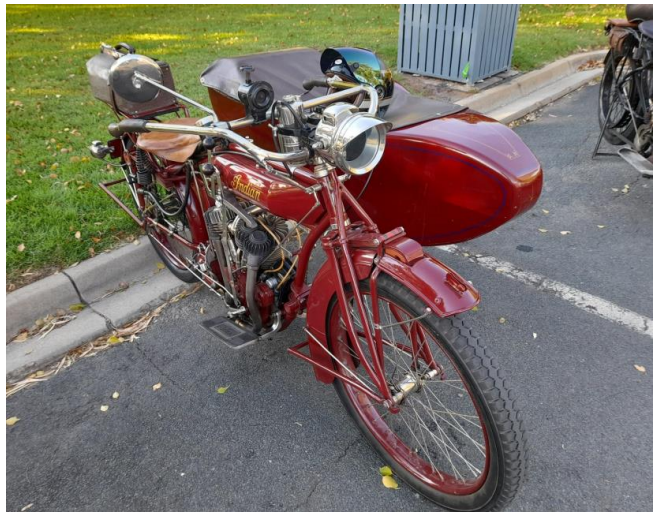
1916 Indian motorcycle outfit