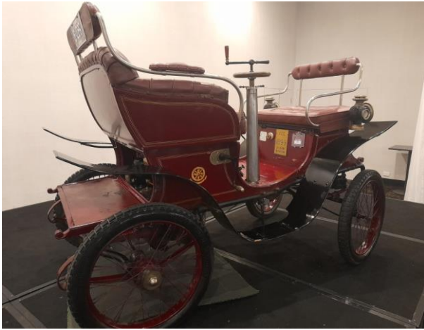
1899 Di Dion Bouton