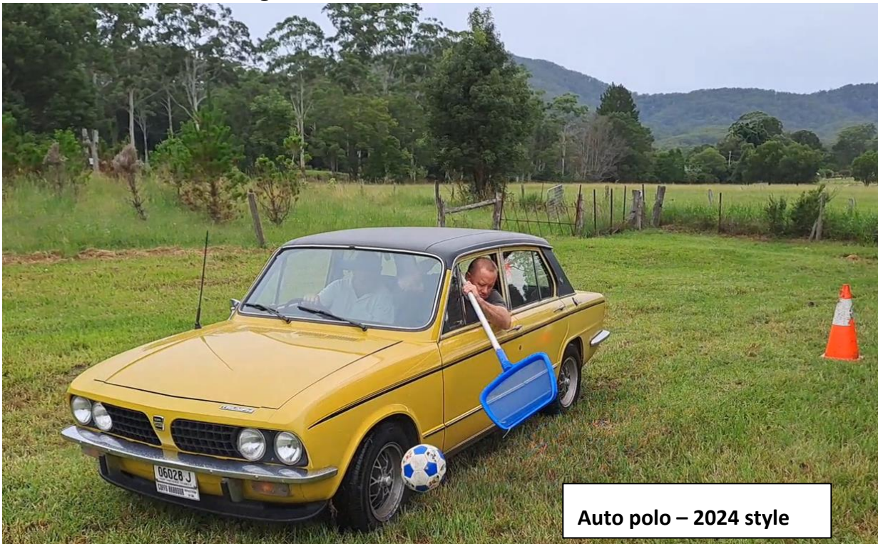
Auto polo – 2024 style

Auto polo was a brief craze in the 1910's to 1930's. It was extremely dangerous and generally used obsolete Model T Ford chassis. More about this crazy sport can be found at the web links below – even a YouTube video showing some original footage!