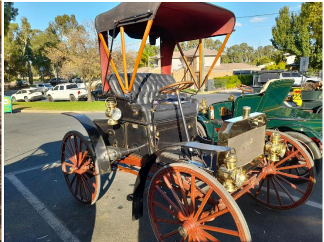
1909 Schacht highwheeler buggy

My favourite bike was the 1916 Indian, 1000 cc the same capacity as our Brush and wow did it get along. The bike was purchased new by the current owner's grandfather and restored by himself and his father.