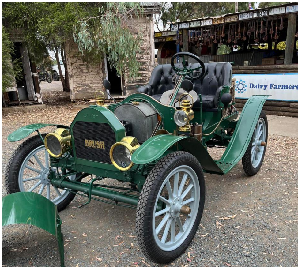
Our 1911 Brush Model F

There were some very interesting and rare cars these included an 1899 Di Dion Bouton (I know some will say it should be a 'De' not a 'Di' but that's what the plaque on the dashboard said). The unusual seating arrangement stands out, a new take on back seat drivers! The car ran very smoothly.