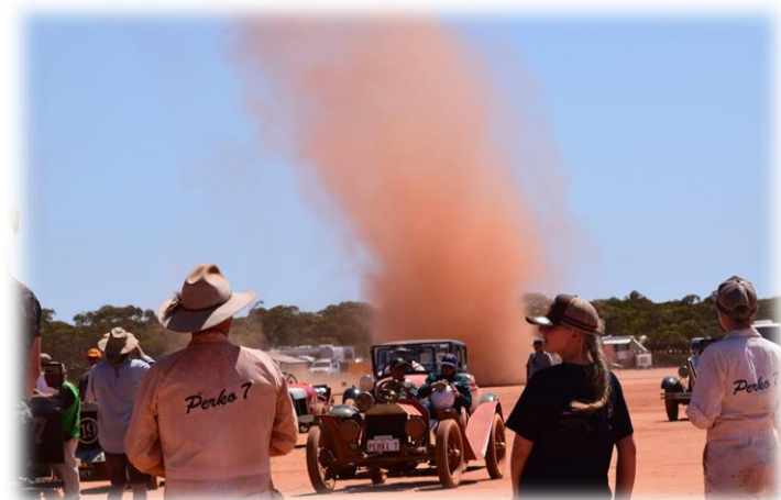
Willys and a Model T