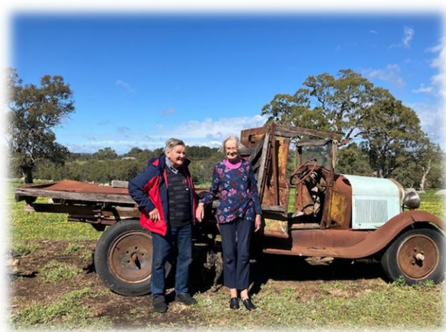
Unrestored AA Truck