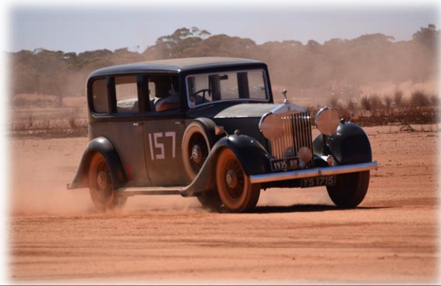
1935 Rolls Royce