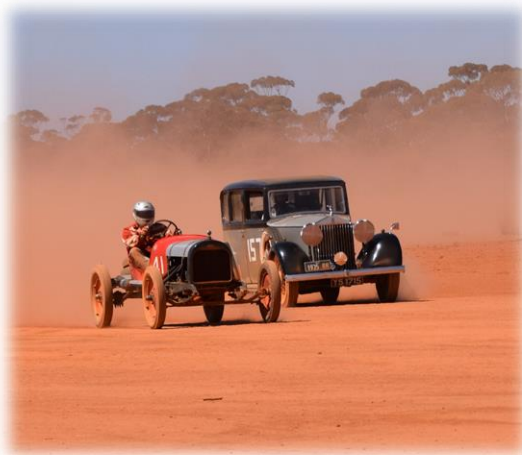
1935 Rolls Royce &amp; 1921 Chev