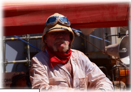
Faces of Racers