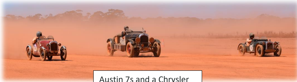
Austin 7s and a Chrysler