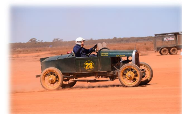
1928 Model A