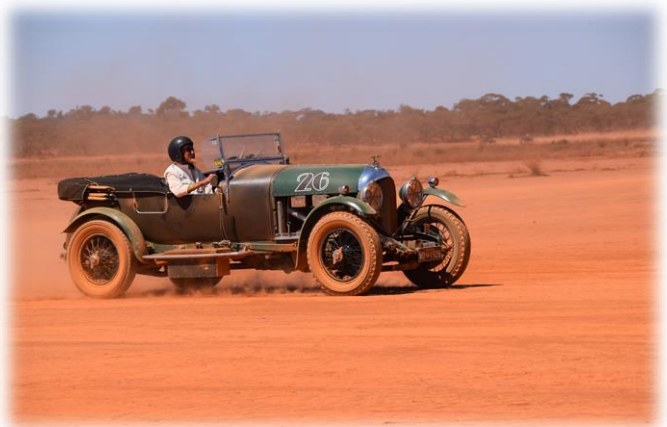
Red Label Bentley