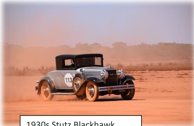
1930s Stutz Blackhawk