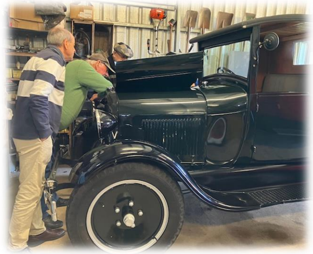
Checking out the restored AA